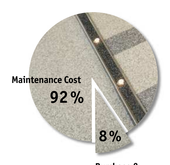
Purchase & installation cost